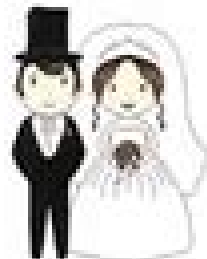
THE 7th COMMANDMENT

Husbands and wives must keep their marriage promises. (Exodus 20:14)