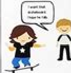
THE 10th COMMANDMENT

Do not be jealous and want what someone else has. (Exodus 20:17)