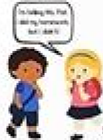
THE 9th COMMANDMENT