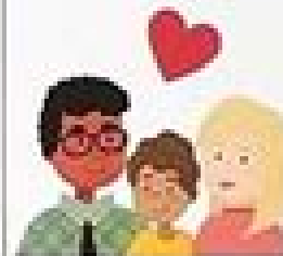
THE 5th COMMANDMENT

Always honor and respect your father and mother. (Exodus 20:12)