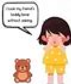
THE 8th COMMANDMENT

Husbands and wives must keep their marriage promises. (Exodus 20:14)