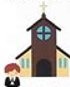
THE 4th COMMANDMENT

Remember the Sabbath day and keep it holy. (Exodus 20:8-11)