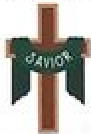
THE 1st COMMANDMENT

Have no other gods before God (Exodus 20:3)