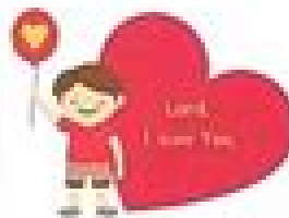
THE 3rd COMMANDMENT

Always speak God's Name with respect. (Exodus 20:7)