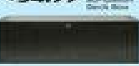
Wicked Box Garden Deck Box