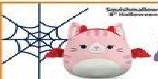
Squishmallows 18" Halloween