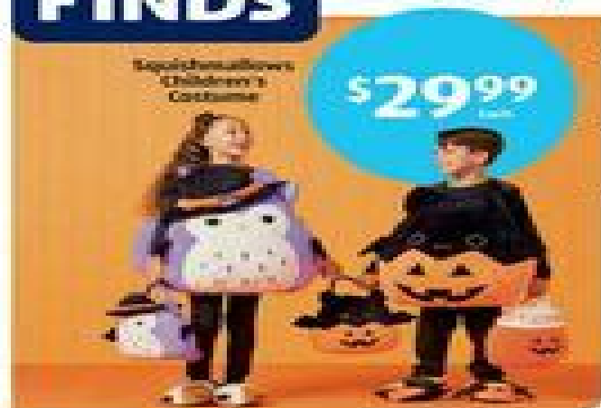
Squishmallows Children's Costume

Unexpected products at amazing prices. Get 'em while they last.