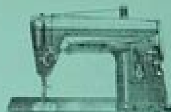
Machine Class 404

** A Trade Mark of THE SINGER MANUFACTURING COMPANY