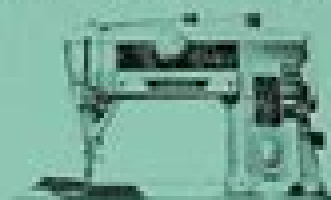
Machine Class 401