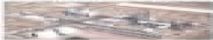
CF expansion nears end Sioux City Journal