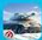
World of Tanks