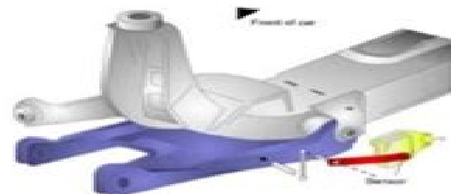
A height sensor mounted on the frame. The actuating arm moves up or down with the suspension, varying a voltage signal at the electrical connection.

Early leveling systems were operated with a manual switch. Later systems are automatic and rely on height sensors to determine the vehicle's attitude. The compressor is switched on, or air is bled out accordingly. System designs and operations vary.