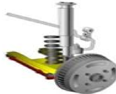
Left: Multi-link rear suspension. This design has two lower control arms. Right: Modified MacPherson strut rear suspension. Note the tie rod end bolted to the control arm, used to adjust rear toe.