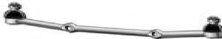
This center link includes bushings for the pitman arm and other arms.