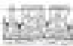
Simple Cuboidal Epithelium