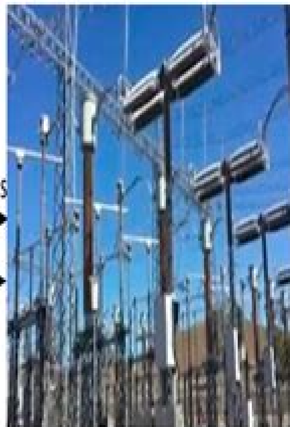
High Voltage Switchyard