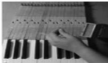
Tape between keys and buttons.