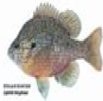
Small sunfish Lepomis microlophus