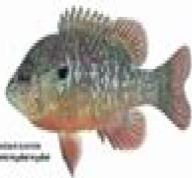
Small sunfish Lepomis microlophus