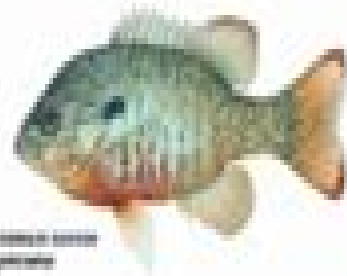
Small sunfish Lepomis microlophus