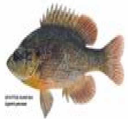
Small sunfish Lepomis microlophus