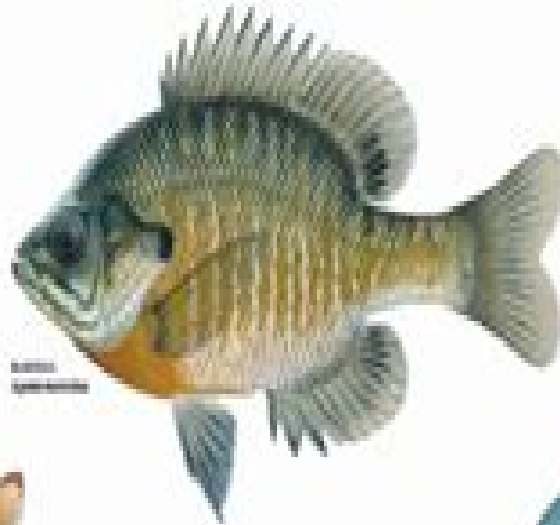
Large sunfish Lepomis macrochirus