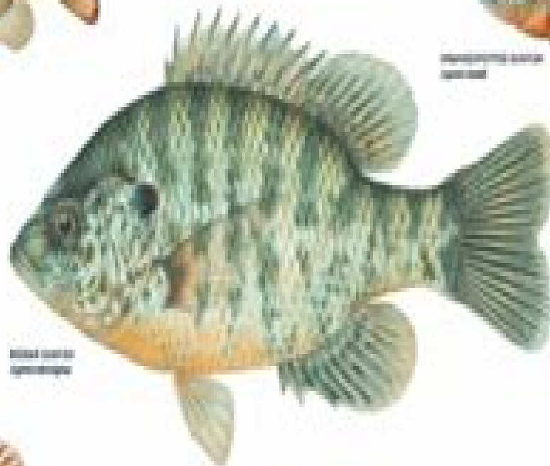
Large sunfish Lepomis macrochirus