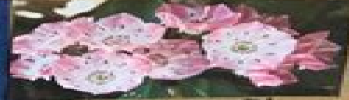
Mountain Laurel State Flower