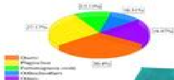
Mineral Composition of Green Sandstone

1. Which mineral is the main component of green sandstone?