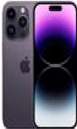
iPhone 14 Pro