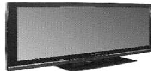
KLV-40 V530A, V550A, V550A/R, V550A/W