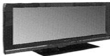
KLV-32 V530A, V550A, V550A/R, V550A/W