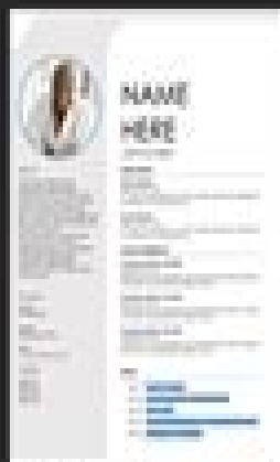
Bold modern resume