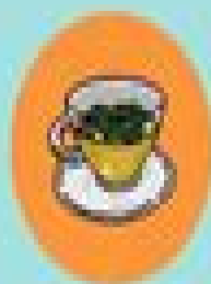
Drinking Herbal Tea