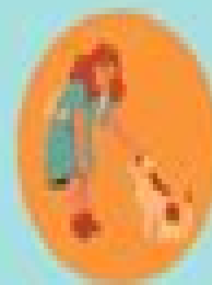
Spending Time With Pet & Animals