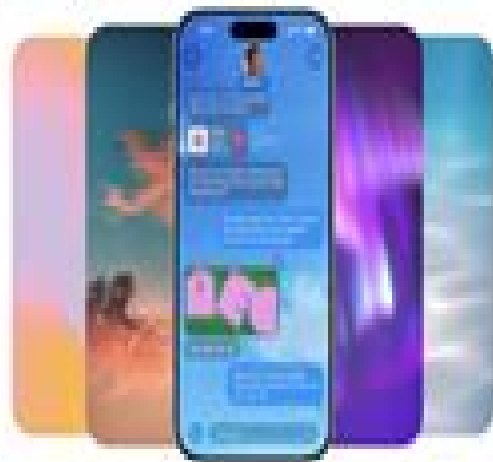
Backgrounds in Messages