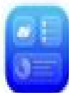
Widgets in CarPlay