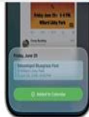
Visual intelligence in screenshots