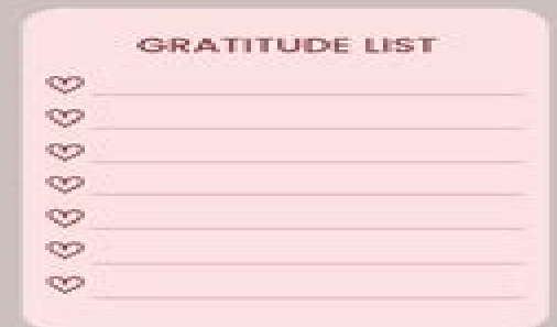
5 minute journal