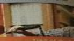
Trail of the Pony