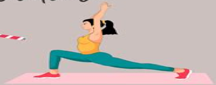
10 minute stretch