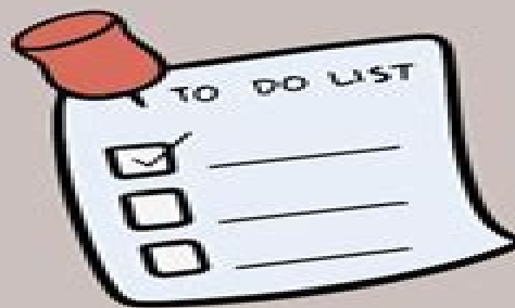
top priority to do list