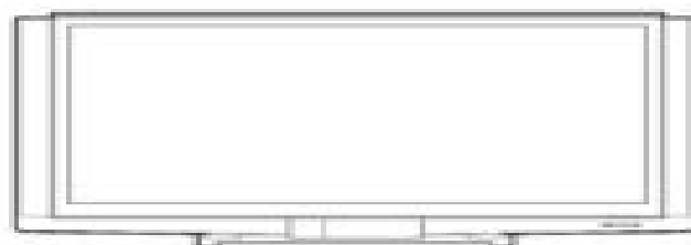
KDF-60XBR950 or KDF-70XBR950