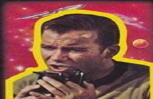
KIRK BEAMING UP!

© 1974 PARAMOUNT PICTURES CORPORATION © 1974 TOPPS/CHARNICK GUM, INC. PRINTED IN U.S.A.