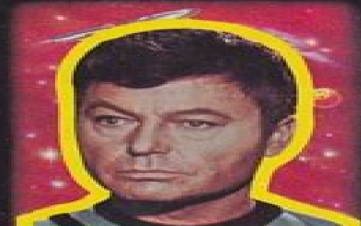
DR. "BONES" MCCOY

© 1974 PARAMOUNT PICTURES CORPORATION © 1974 TOPPS/CHARNICK GUM, INC. PRINTED IN U.S.A.