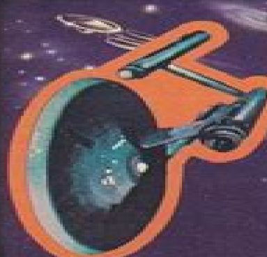
THE STARSHIP ENTERPRISE

© 1974 PARAMOUNT PICTURES CORPORATION © 1974 TOPPS/CHARNICK GUM, INC. PRINTED IN U.S.A.