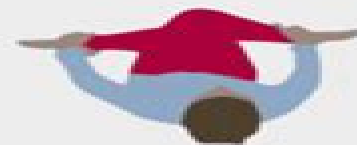
RECLINING COW FACE