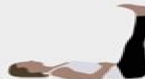
LEGS UP THE WALL