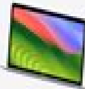
MacBook Air with M1 chip

Education pricing shown for all Mac models.