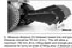
Front Wheel Assembly and Storage Position