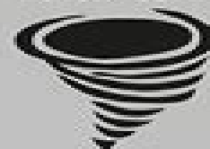
THE WIZARD OF OZ VICTOR FLEMING