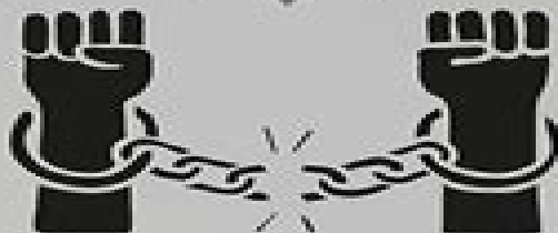
THE SHAWSHANK REDEMPTION FRANK DARABONT