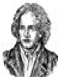
Ludwig van Beethoven 1770-1827 A.D. German composer and piano virtuoso whose music is among the best known of all time