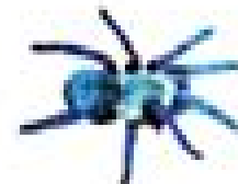
Cobalt Blue Tarantula