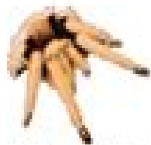
Arizona Blond Tarantula