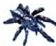
Gooty Sapphire Tarantula