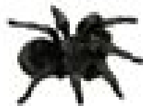
Brazilian Black Tarantula