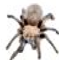
Texas Brown Tarantula