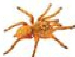
Orange Baboon Tarantula