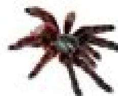
Hercules Baboon Tarantula