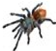
Greenbottle Blue Tarantula