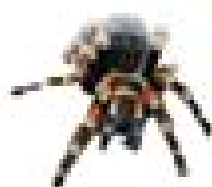
Mexican Red Knee Tarantula