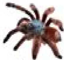
Antilles Pinktoe Tarantula