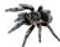
Costa Rican Zebra Tarantula