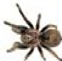
Rose Hair Tarantula