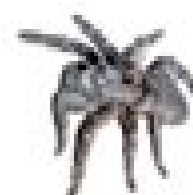
Horned Baboon Tarantula