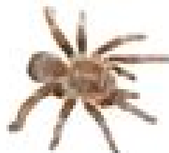
King Baboon Tarantula