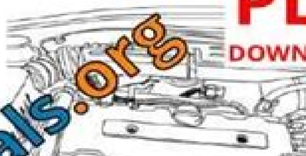
Fig. 30: Identifying Breather Tube To Camshaft Cover (1 Of 2) Courtesy of SUZUKI OF AMERICA CORP.