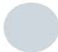
Benjamin Moore Beacon Gray