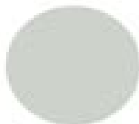
Sherwin-Williams Sea Salt