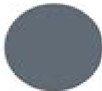
Sherwin-Williams Granite Peak