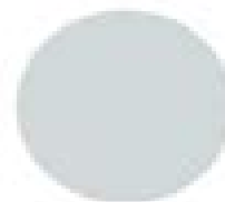
Benjamin Moore Blue Lace