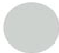
Benjamin Moore Sterling