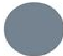
Benjamin Moore Bachelor Blue