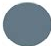
Benjamin Moore Stillwater