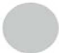
Sherwin-Williams Gray Screen