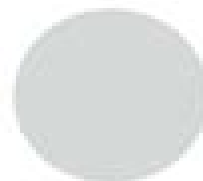
Sherwin-Williams Olympus White