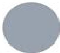
Benjamin Moore Comet