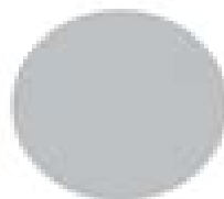
Sherwin-Williams Lazy Gray