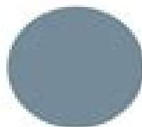
Sherwin-Williams Bracing Blue