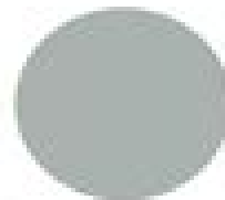
Benjamin Moore Boothbay Gray