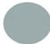
Valspar Blue Arrow