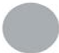
Sherwin-Williams Morning Fog