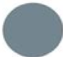
Behr Adirondack Blue