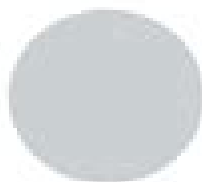
Sherwin-Williams North Star