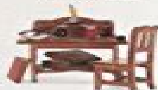
WOODEN DESK & CHAIR