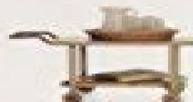
WOODEN TEA CART