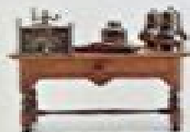
TABLE WITH LAMP