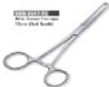
ALLIS Allis Tissue Forceps (Non Wood Handle)