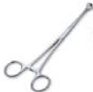
BABCOCK Babcock Forceps 17cm