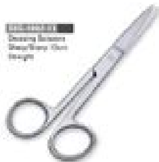
DRESSING Dressing Scissors Sharp/Blunt 13cm Straight