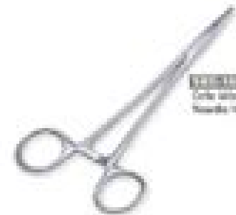
CRILE WOOD Crile Wood Needle Holder, 15cm