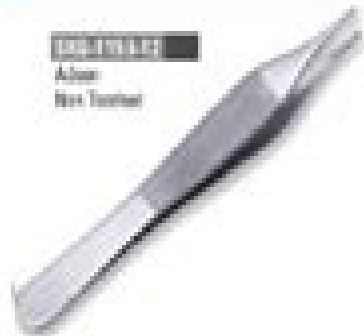
ADSON Adson Non Toothed