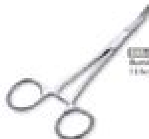
DUNHILL Dunhill Artery Forceps 12.5cm, Curved