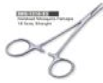
HALSTEAD Halstead Mosquito Forceps 12.5cm, Straight