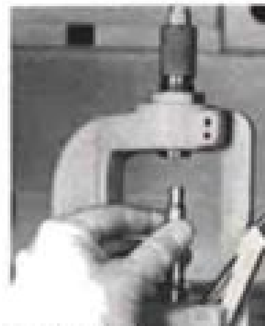
Place case in shell holder

from getting into the powder. Next, set the powder dispensing adjustment for the correct powder charge. This will probably require a few minor adjustments, plus or minus, until the exact charge is obtained. It is very easy to do using the powder scale to weigh the charges dispensed. Once the correct setting is obtained, read the setting on the measure and record it in a reloading notebook for future reference. Charge all the resized and primed cases. Visually check each case to be sure that none have been double charged or under charged with powder. You are now ready to seat the bullet in the cartridge case. Do not leave powder in the measure for