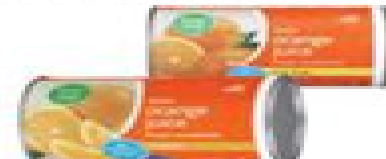
FOOD CLUB ORANGE JUICE assorted, 12 oz.