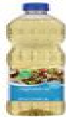
FOOD CLUB VEGETABLE OIL 40 oz.