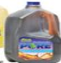
PANHANDLE PURE TEA OR LEMONADE assorted, gallon