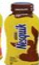
NESTLE NESQUIK select varieties 14 oz.