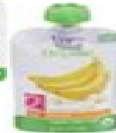
TIPPY TOES ORGANIC BABY FOOD assorted, 3.5 oz.