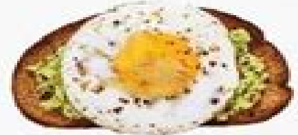
avocado, egg & chili flakes