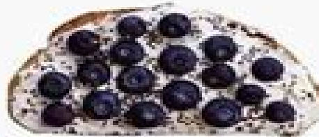
blueberries, greek yogurt & chia seeds