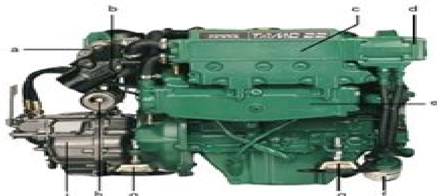
TAMD22P with HS25A reverse gear

Due to the turbo wastegate technology, the engine's characteristics allow full throttle operating range from 3500 to 4500 rpm. This gives high flexibility for different applications.