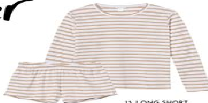
13. LONG SHORT PAJAMA SET