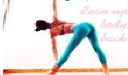
10. Triangle pose