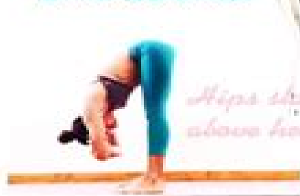
1. Forward fold