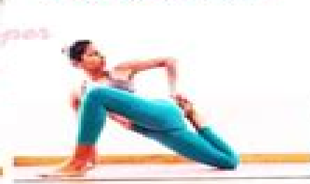
9. Quad stretch