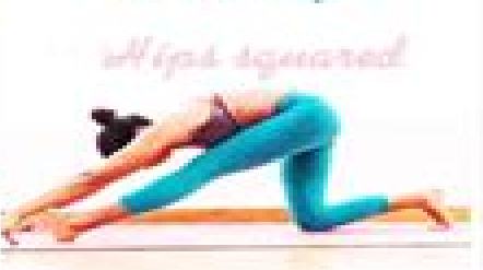
6. Half split