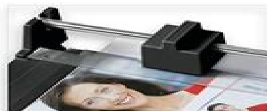
The blade is encased in a protective housing for safety.