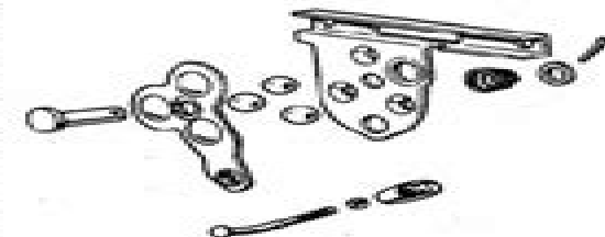
Clutch operating mechanism