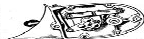
Clutch mechanism installed