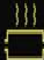
Catalytic converter warning