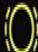
Brake pad warning