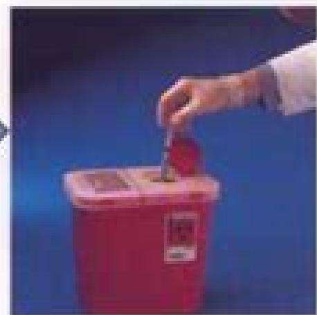
Fig. 18-89 Discard needles in puncture-resistant containers.