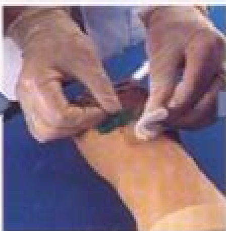
Fig. 18-88 Remove the IV access.