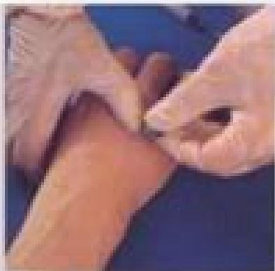
Fig. 18-84 Insert the vein and enter the vein with the needle at a 45-degree angle.