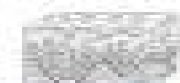
Simple Cuboidal Epithelium

Classify each tissue as an epithelial or connective tissue.