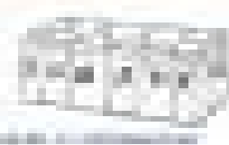
Simple Columnar Epithelium