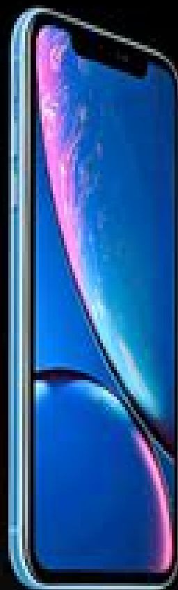
iPhone X ®