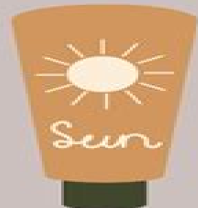
go out for fresh air