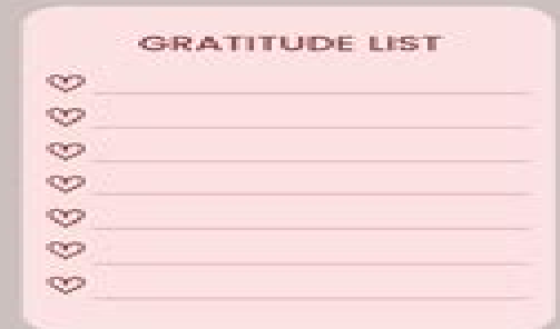
5 minute journal