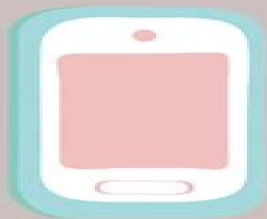
go screen free for 30 minutes