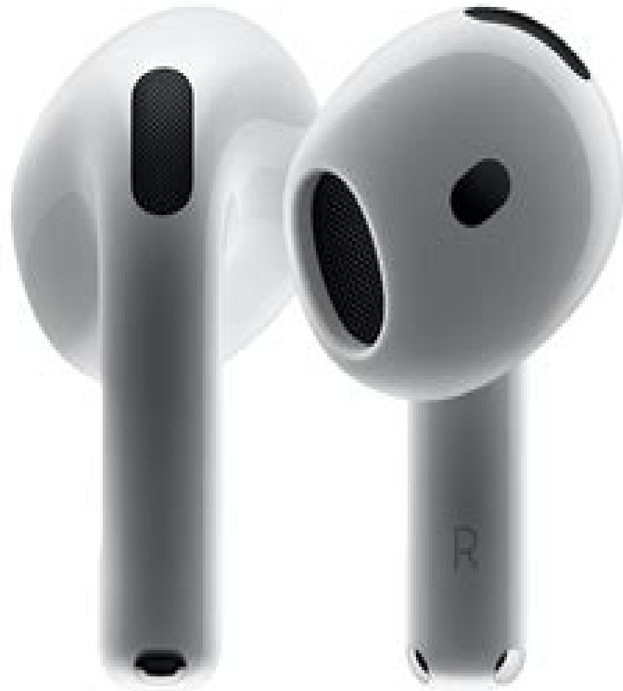
Apple AirPods 4