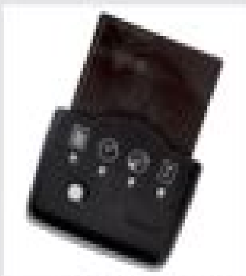
MiniLink to be purchased separately