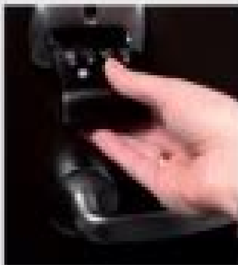
Upload/download lock information