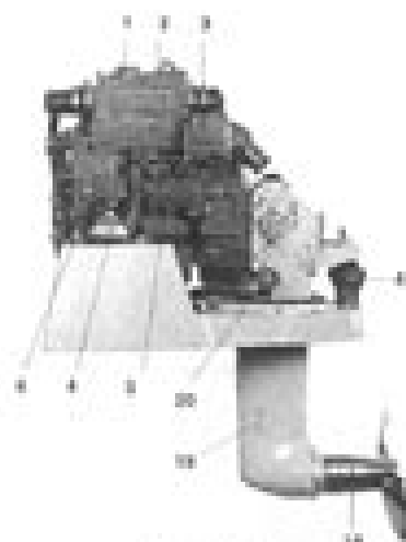
MD2010B & MD2020B