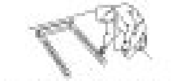
● 本產品 在安裝前 請先將 說明書 內容 讀完。

● 本產品 在安裝前 請先將 說明書 內容 讀完。 ● 本產品 在安裝前 請先將 說明書 內容 讀完。 ● 本產品 在安裝前 請先將 說明書 內容 讀完。